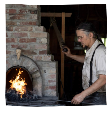
Barkerville Heritage Trust $10,000.00