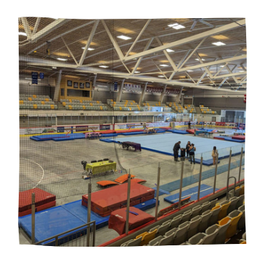
Quesnel Technics Gymnastics Club $7,500.00