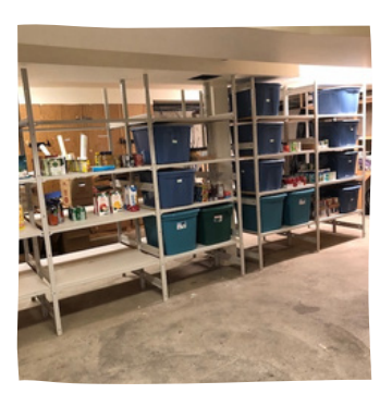
Bouchie Lake Community Association $3,000.00