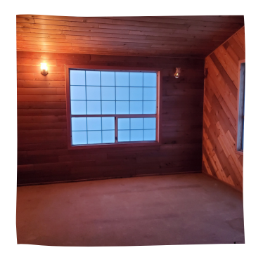
Island Mountain Arts Society $8,000