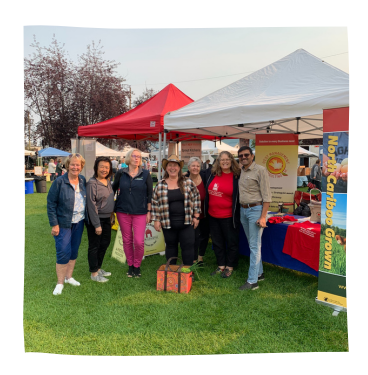
North Cariboo Agricultural Marketing Association $7,415.00