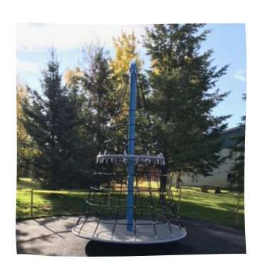
Kersley Community Association $12,000.00