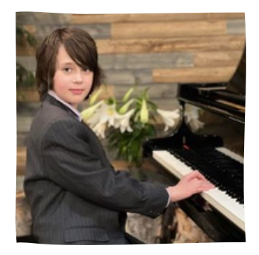
Quesnel Festival of the Performing Arts $2,500.00