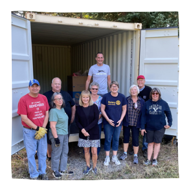
Rotary Club of Quesnel $6,340.00