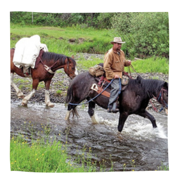
Back Country Horsemen of BC $11,000.00