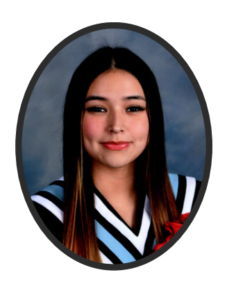
Dhana Aldred Gorsline Family Bursary $1,900.00