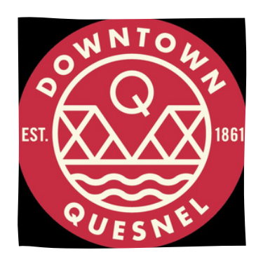
Quesnel Downtown Association $1,100.00