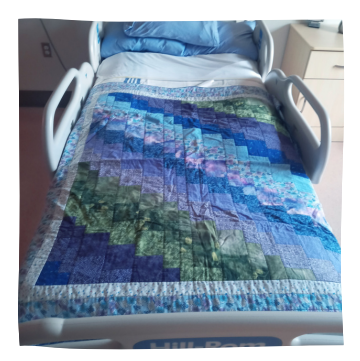
Quesnel & District Hospice Palliative Care Association $6,000.00