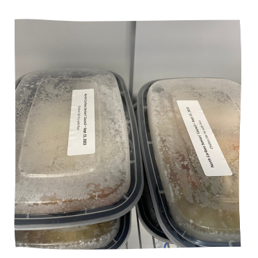
North Cariboo Seniors' Council $1,600.00