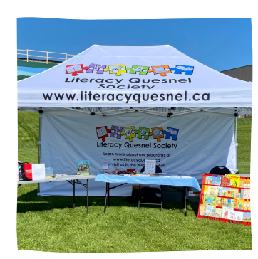
Literacy Quesnel Society $2,830.00