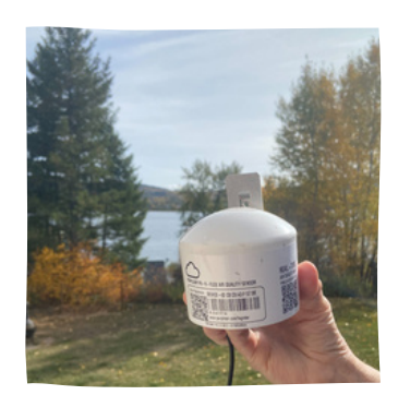
Baker Creek Enhancement Society $4,500.00