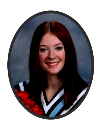
Sierra Bullock Gorsline Family Bursary $1,900.00