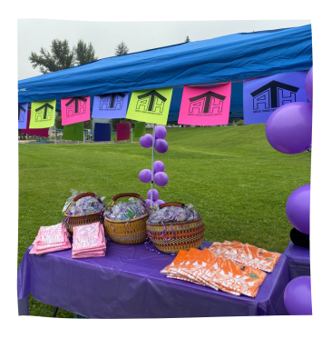
Amata Transition House Society $3,000.00