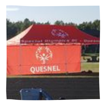
Special Olympics BC -Quesnel $1,775.00